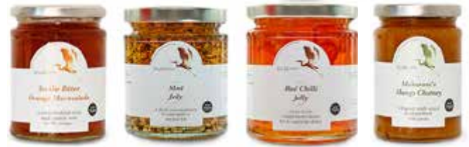
Award winning jams, marmalades, pickles, chutneys and jellies produced in Sussex, England