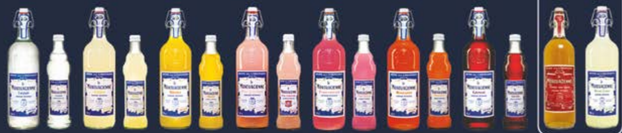
Clear Lemonade, Cloudy Lemonade, Orange Lemonade, Pink Lemonade, Grapefruit Lemonade, Mandarin Lemonade, Pomegranate Lemonade, Seasonal: Spiced Apple Lemonade 1L, Mint & Lime Lemonade 1L